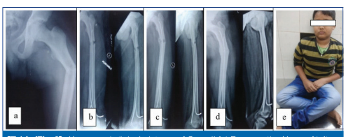
[Table/Fig-2]: X-rays and clinical pictures of Case-II {a) Preoperative X-ray of left femur proximal third fracture; b) Immediate postop; c) X-ray at six weeks showing Anthony Grade 2 callus; d) X-ray at six months; e) Clinical picture at six months}.