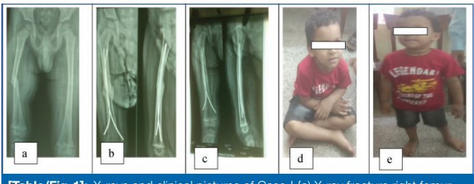
[Table/Fig-1]: X-rays and clinical pictures of Case-I {a) X-ray fracture right femur (AP); b) Immediate post-op; c) six months post-op; d) Cross leg sitting at six months; e) Full weight bearing}.

Patients were followed-up at six weeks, three months, six months and one year [Table/Fig-1]. Non weight-bearing was advised for first six weeks and gradually weight-bearing allowed with confirmation of Grade 3 callus formation on radiology as per Anthony et al., scale [9] for grading of callus formation [Table/Fig-2,3]. Functional assessment was done according to TENS criteria by Flynn JM et al., [Table/Fig-4] [12] implant removal was done in all cases between 4-6 months of surgery.